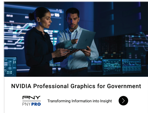
Sample Google Display Ad

Reporting - PNY will provide the metrics to the participating partners a week after the campaign has been completed.